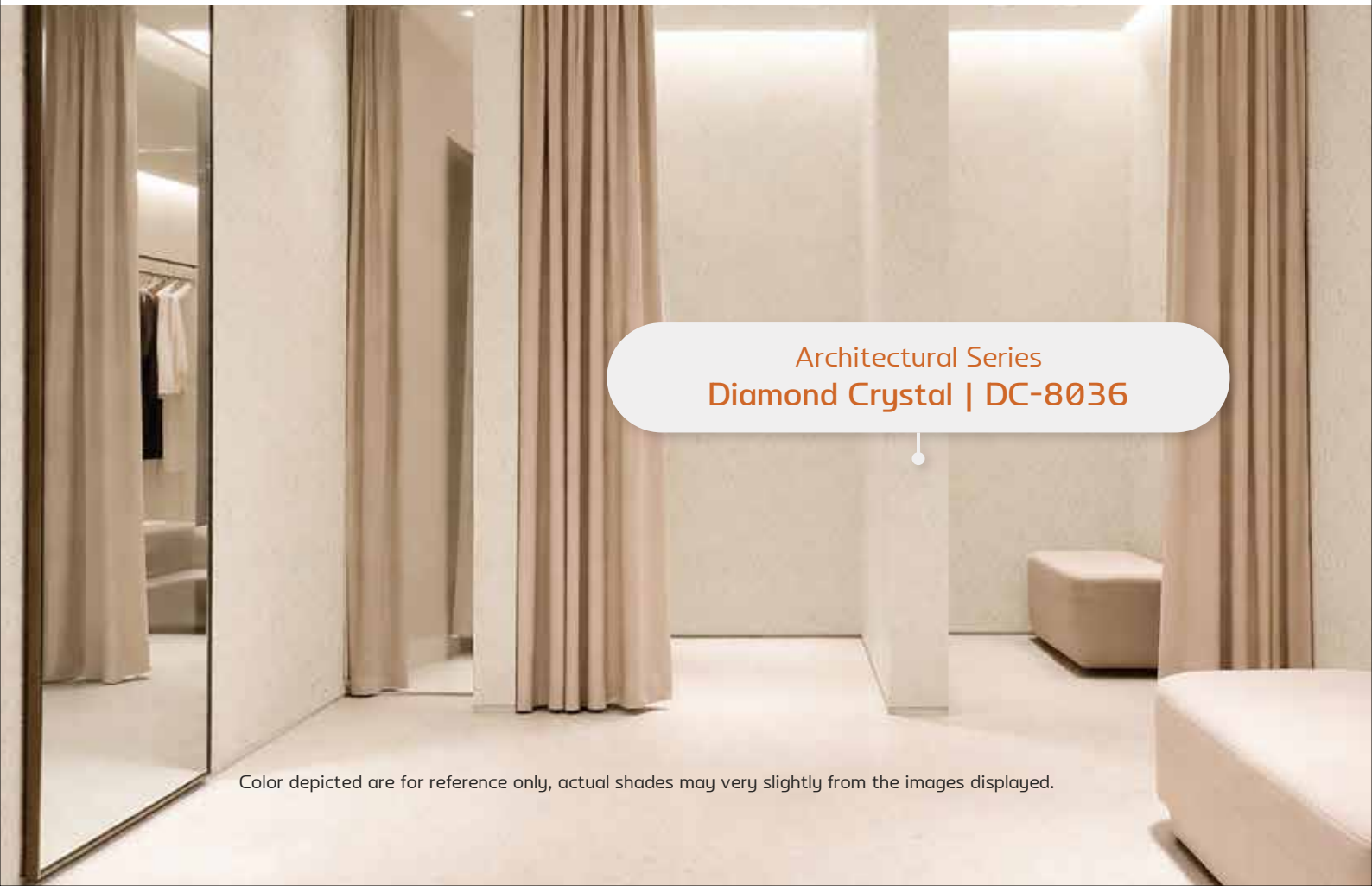
Architectural Series Diamond Crystal | DC-8036

Color depicted are for reference only, actual shades may vary slightly from the images displayed.