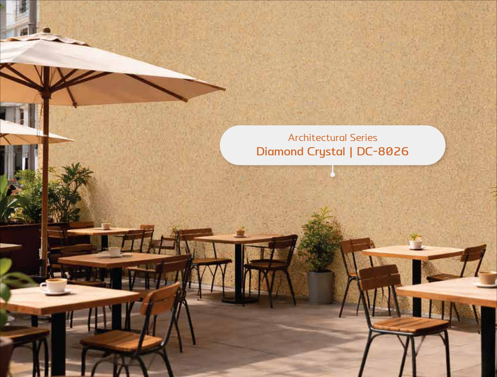
Architectural Series Diamond Crystal | DC-8026