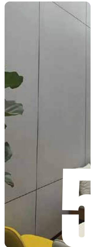
Cement Fiber Boards