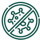
Protection against Fungus & Algae