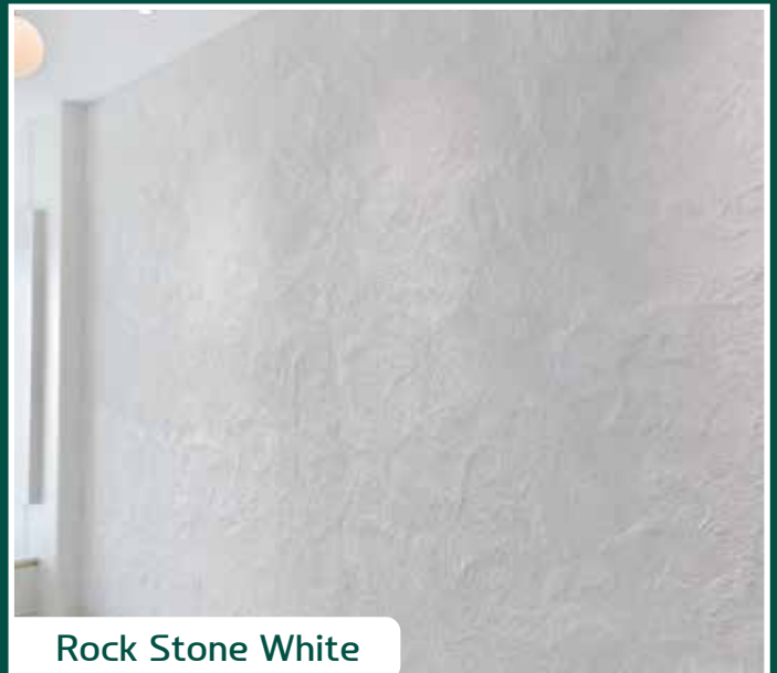
Rock Stone White