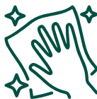
Easy to Maintain