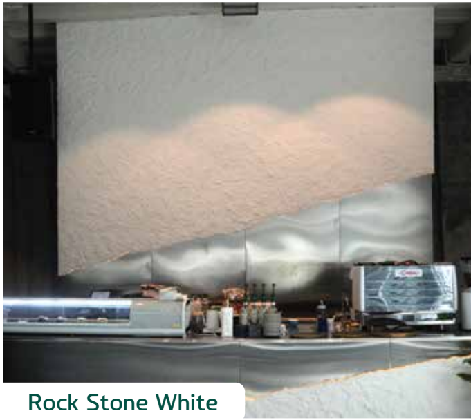
Rock Stone White