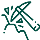
High Hardness Level