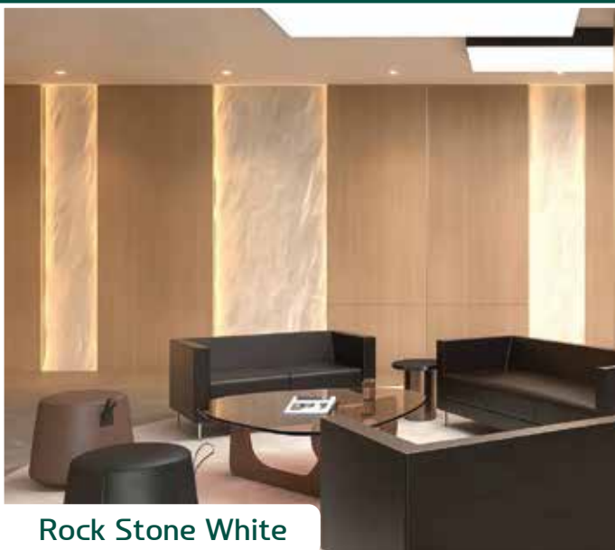
Rock Stone White