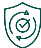
Long-Lasting (Lifespan of over 15 years)