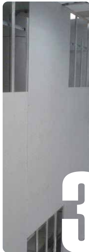
Calcium Silicate Boards