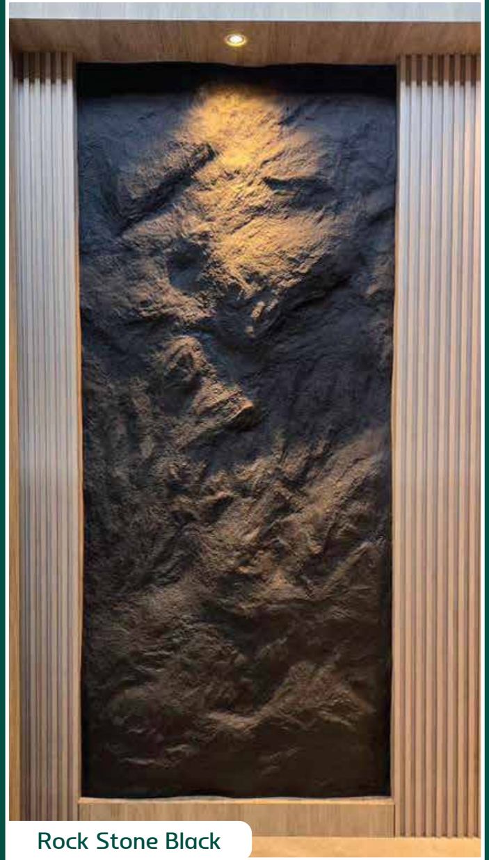
Rock Stone Black