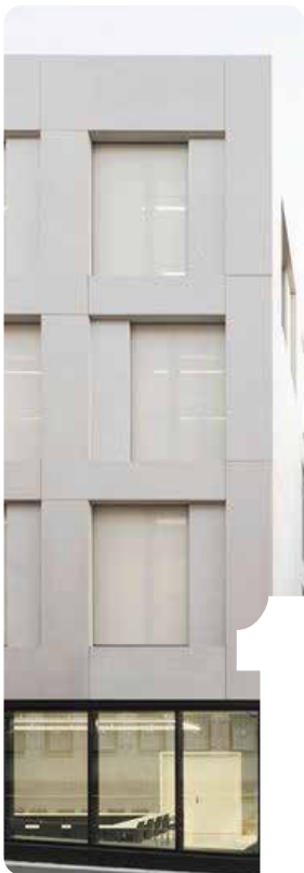
Internal and External Walls