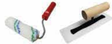
Recommend Tools: Roller, Plastic Trowel

Apply texture paint (a) with a trowel, perform a random motion to create desired texture.