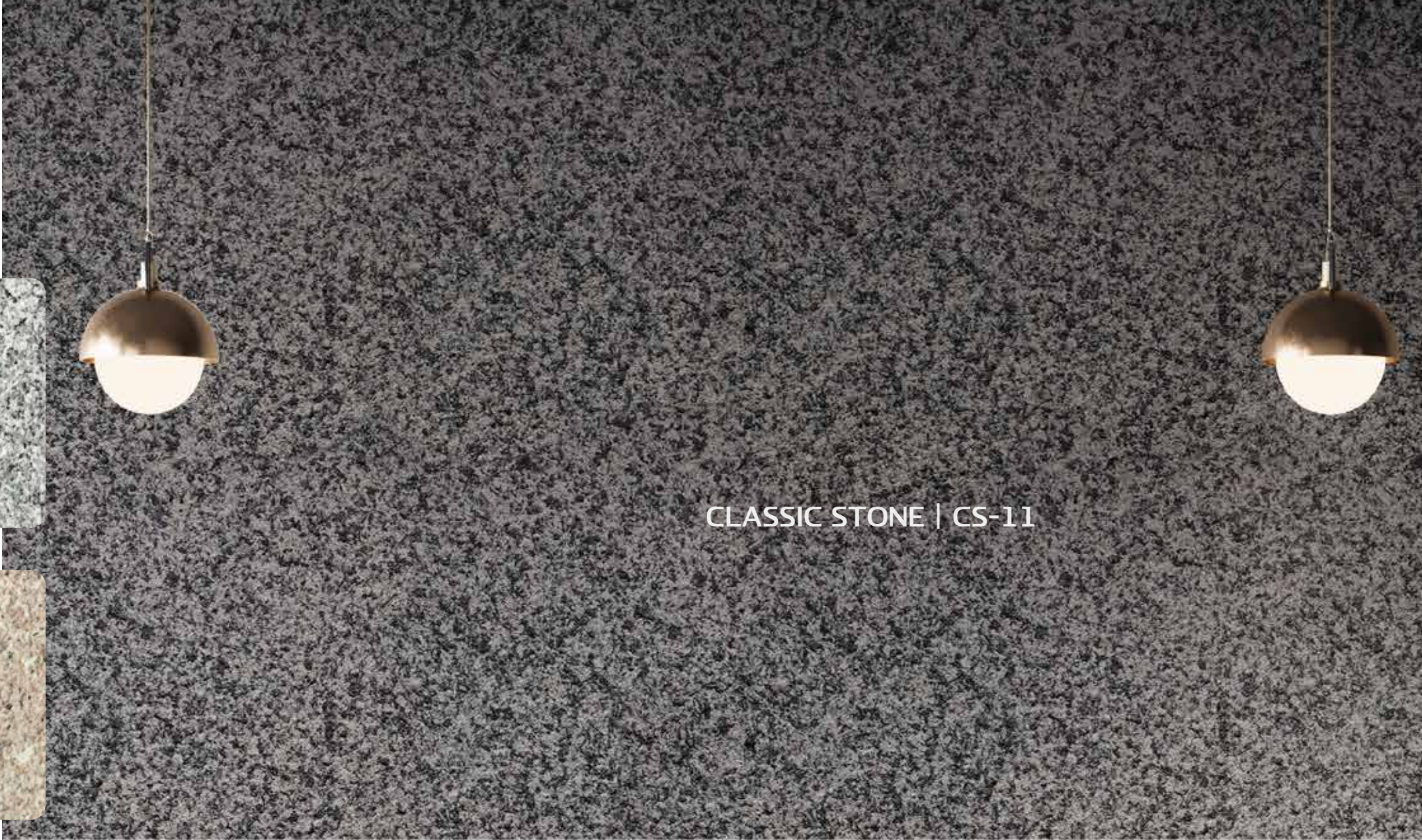
CLASSIC STONE | CS-11

Colors depicted for MOKAY® Classic Stone are as close as possible to reality, but slight variations may occur due to modern painting techniques. It's advisable to view actual samples before ordering.